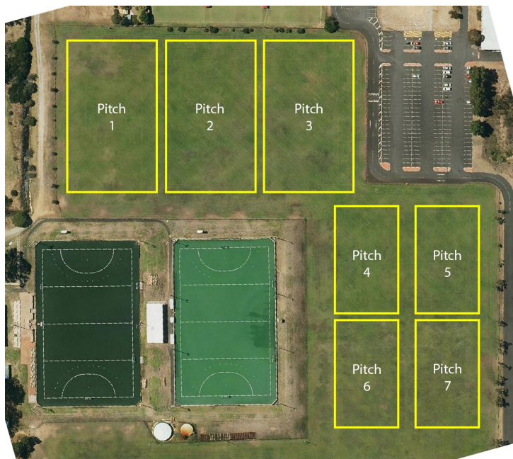
Hay Park South – Hockey