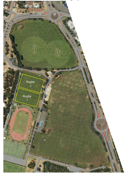
Hay Park Central - Rugby