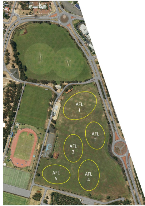
Hay Park Central – AFL