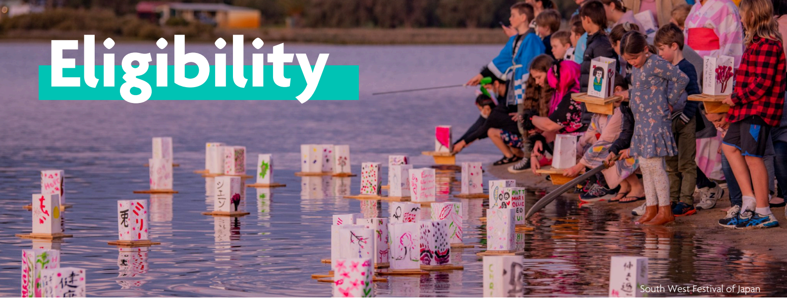
South West Festival of Japan