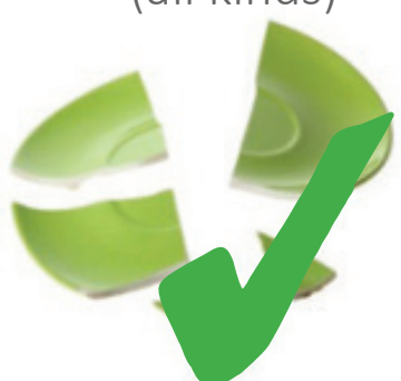
Ceramic and pottery