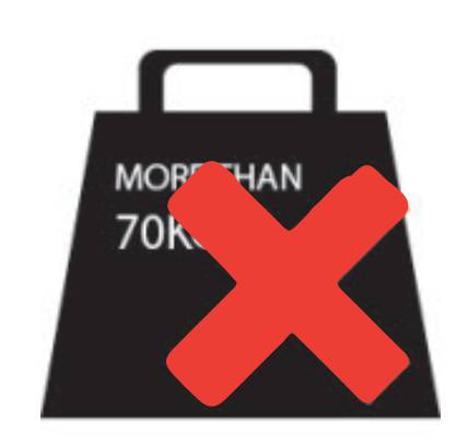
More than 70Kg