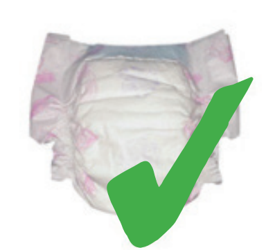
Nappies & wipes (all kinds)