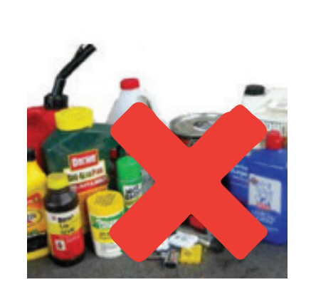
Chemicals and poisons