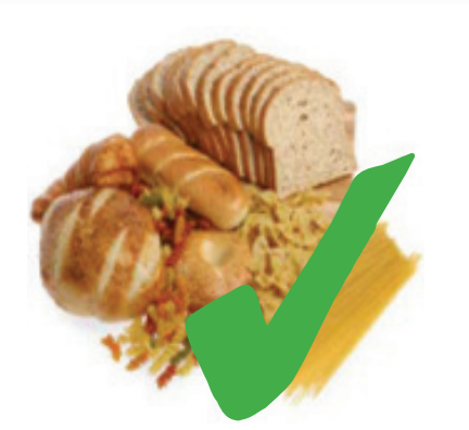
Grains and pasta