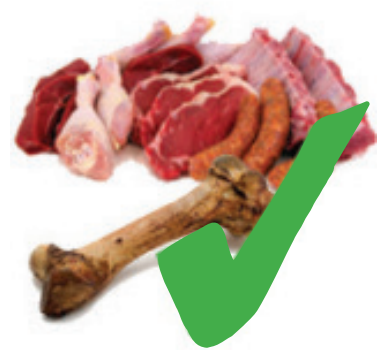
Meat and bones