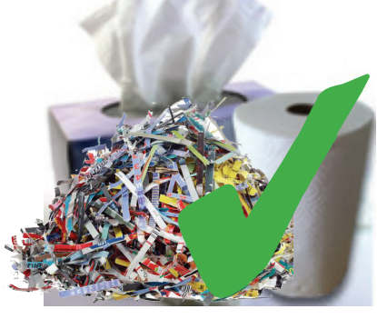
Shredded paper and paper products