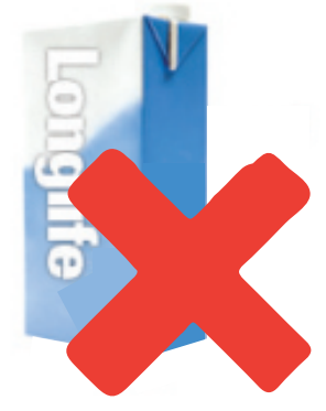
Silver-lined UHT cartons