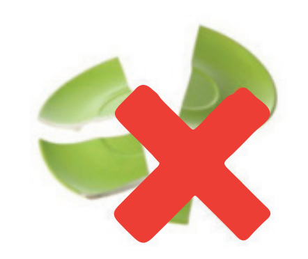
Ceramic and pottery