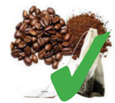
Coffee and tea