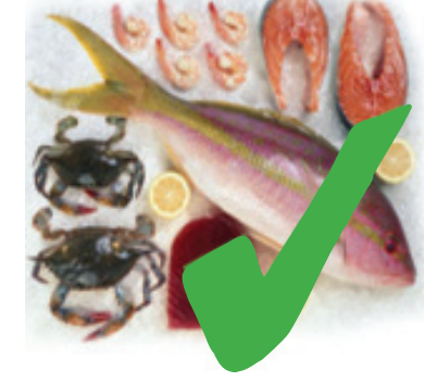
Fish and shellfish