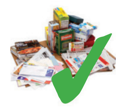
Paper and cardboard (flat)