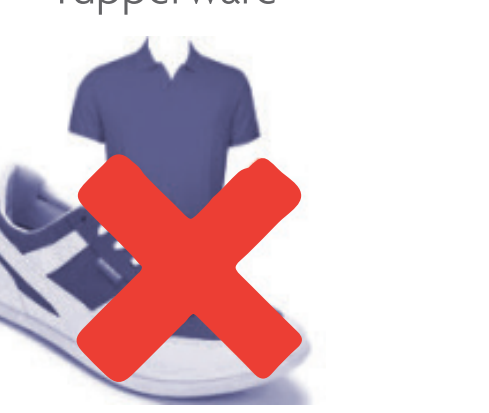
Clothing or textiles