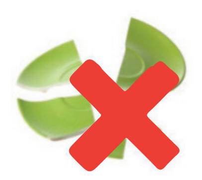
Ceramics or glass