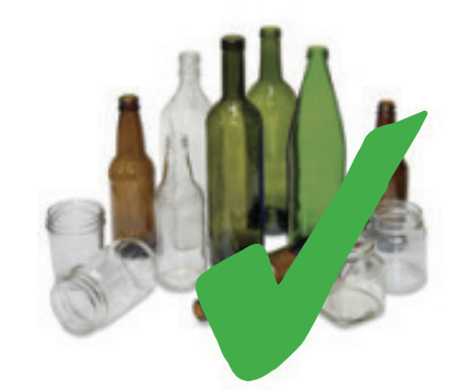
Glass bottles (lids removed)