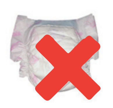
Nappies & wipes