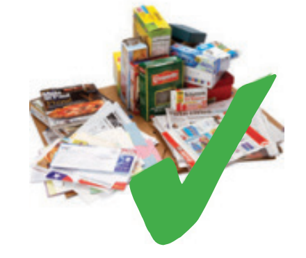
Paper and cardboard