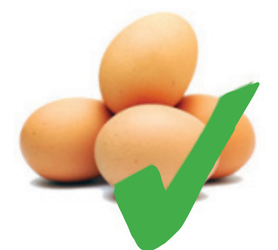
Eggs and shells