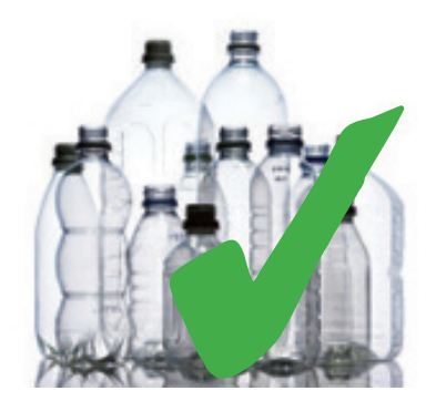
Plastic bottles and containers 1-6 (lids removed)