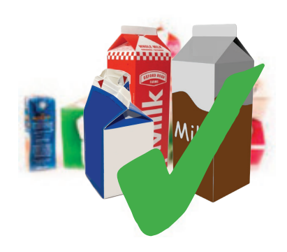
Cardboard drink cartons