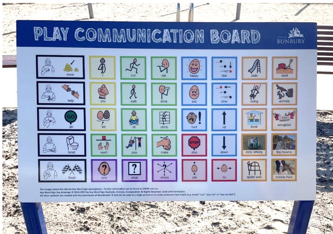
Image 1: City of Bunbury Communication Board located at Koombana Bay, Bunbury.

Augmentative and Alternative Communication (AAC) (speechpathologyaustralia.org.au)