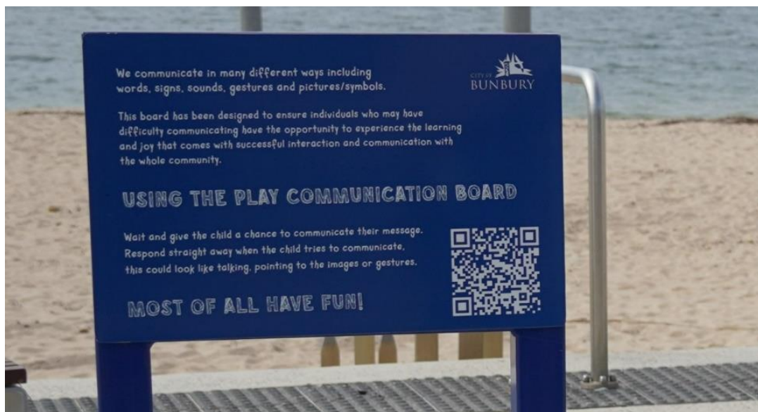
Image: Communication Board Information sign.

The information signs include how to use the Communication Board and a QR code which links to Speech Pathologist Association of Australia Augmentative and Alternative Communication information.