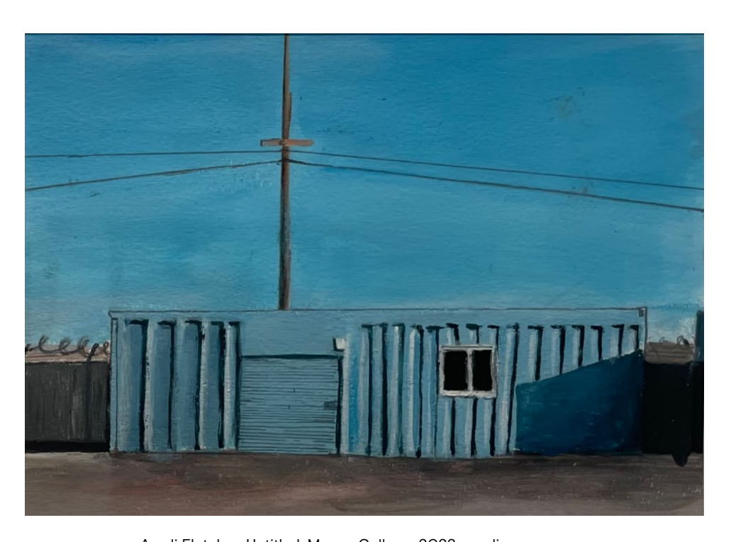
Amali Fletcher, Untitled, Manea College, 2022, acrylic on paper.