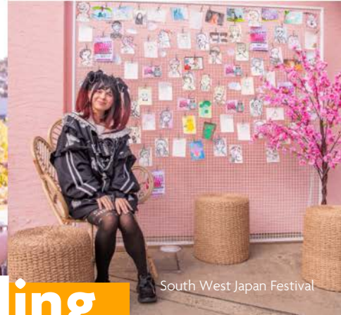
South West Japan Festival