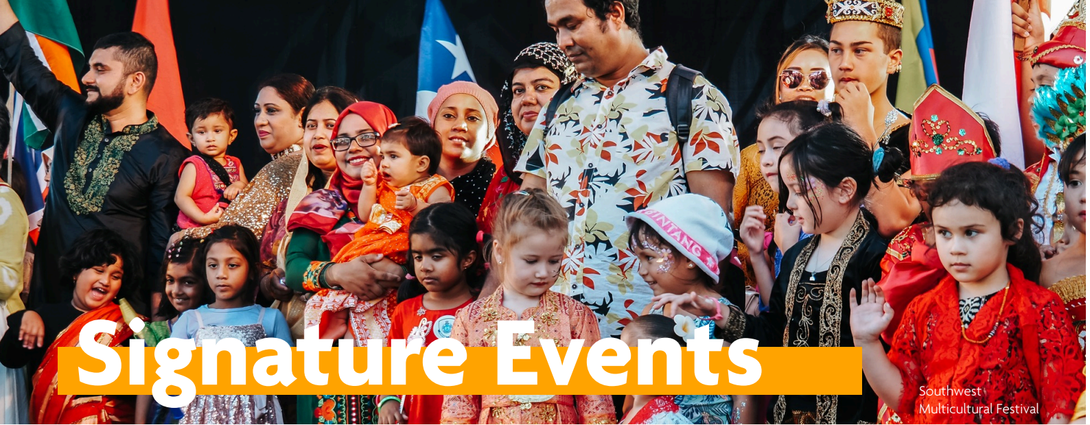
Southwest Multicultural Festival