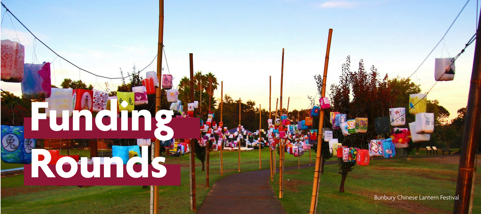
Bunbury Chinese Lantern Festival