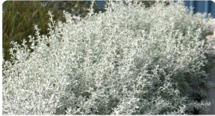
OLEARIA AXILLARIS 'BEACH BALL'