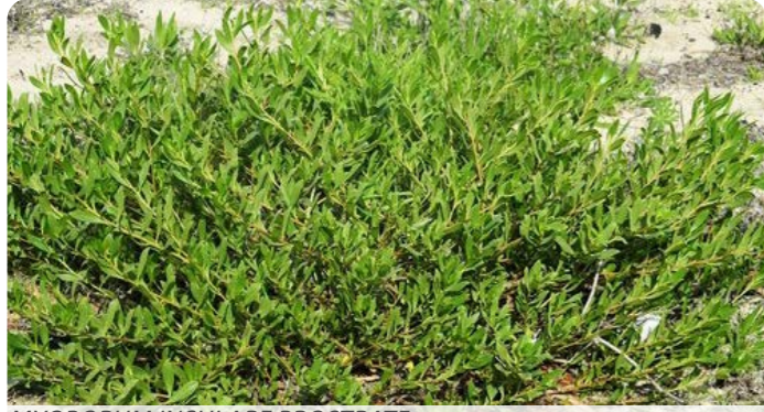
MYOPORUM INSULARE PROSTRATE