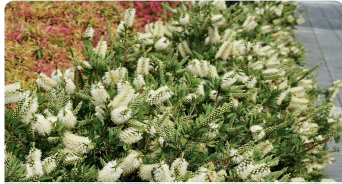
CALLISTEMON 'WHITE ANZAC'