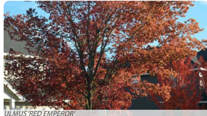
ULMUS 'RED EMPEROR'