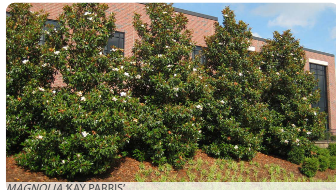
MAGNOLIA 'KAY PARRIS'