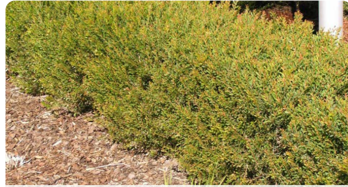
MELALEUCA 'LITTLE NESSIE'