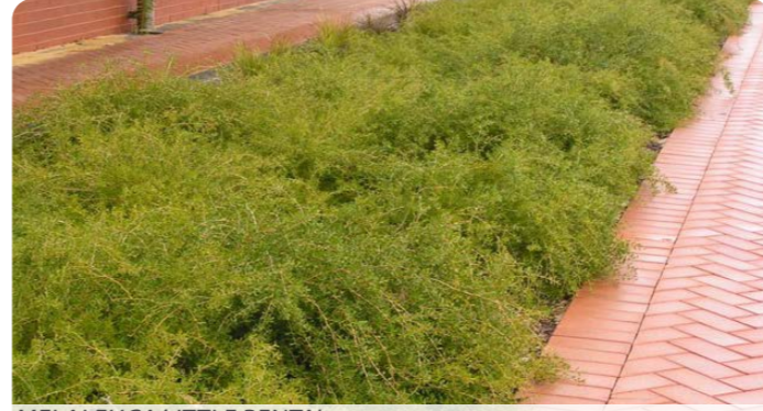
MELALEUCA 'LITTLE PENTA'