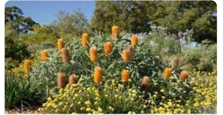
BANKSIA ASHBYII DWARF