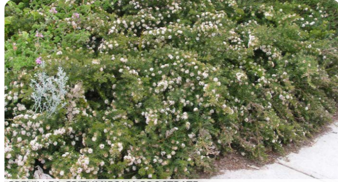
GREVILLEA CRITHMIFOLIA PROSTRATE