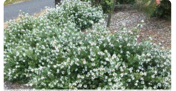
WESTRINGIA 'LOW HORIZON'