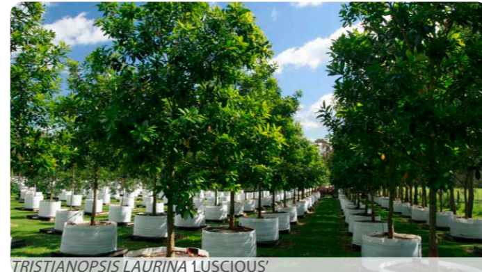
TRISTIANOPSIS LAURINA 'LUSCIOUS'