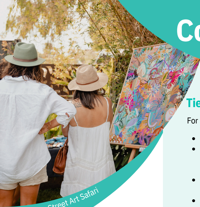
Tree Street Art Safari