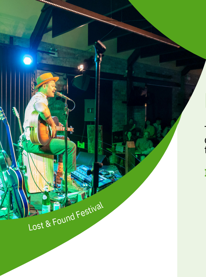
Lost & Found Festival