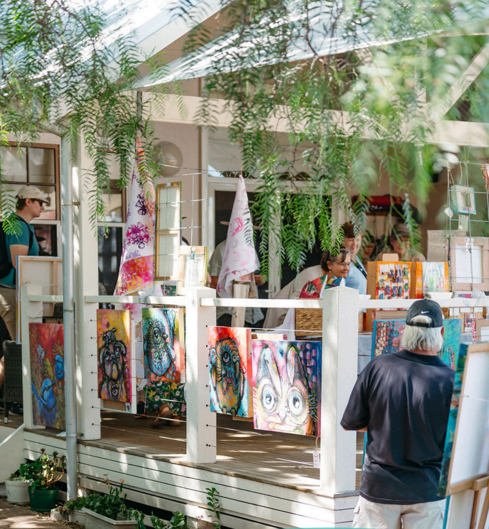
Tree Street Art Safari