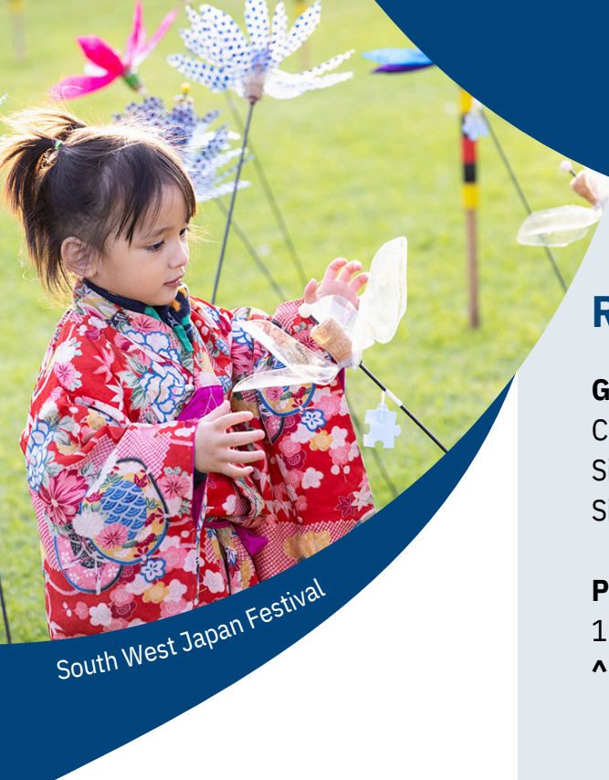
South West Japan Festival